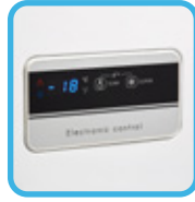
Easy-to-use Electronic Controls