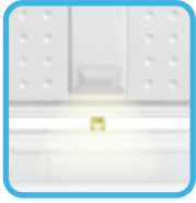
Automatic Internal LED Lighting