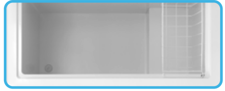
Large Storage Capacity + Removable Storage Basket