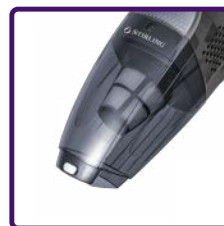
Easy to empty Dust Canister

For best performance, make sure the battery has been fully charged (12 hours) the first time the Vacuum is used. After that, normal charge time is 4-5 hours.