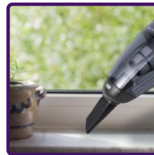
Crevice Nozzle for Corners