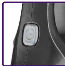
Alternative Power Switch