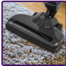
Rotating Floor Brush with Swivel Head