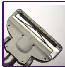
Brush Picks Up Dust, Dirt or Crumbs Easily