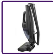
Foldable Handle for Easy Storage

Caution! Only use the supplied Mains Adaptor to charge your Vacuum Cleaner.