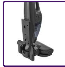
Easy to Park and Charging Station