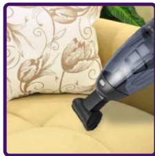
Brush Attachment for Dusting