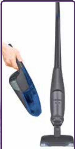
Detachable Handheld Vacuum Cleaner

Cordless handstick or handheld operation Bagless technology